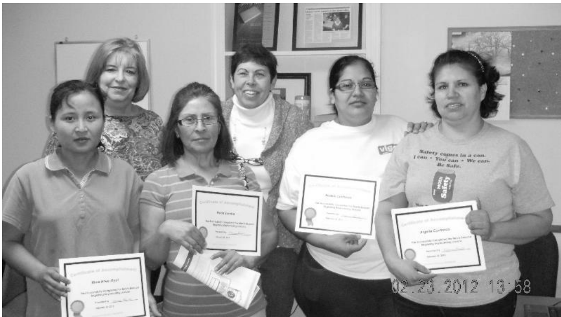
Students Stand With Their Instructors and Certificates.